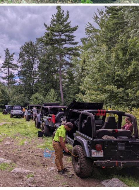
Class VI continued from page 2